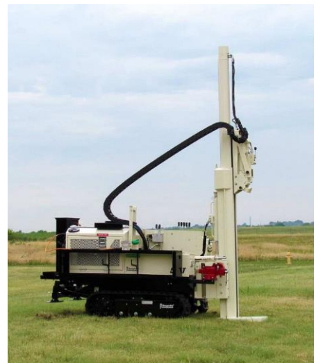
Soil Boring Machine