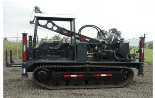
Soil Boring Machine